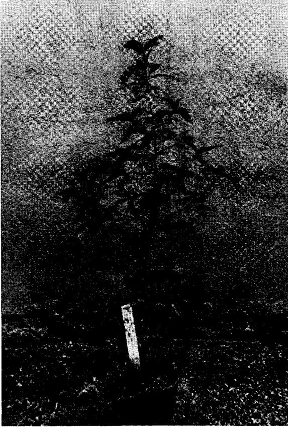
Fig. 3. One of the 3 plants of Gothenburg Botanical Gardens. August 1964.