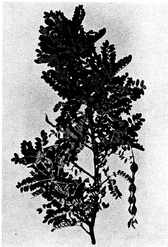
Fig. 1. Sophora toromiro (PHIL), SKOTTSB., with pod. Reprint from SKOTTSBERG'S "The Phanerogams of Easter Island".

The matter is no less interesting in the way that these widely separated, endemic species, although by no means identical, are so closely related that with the exception of the said S. chrysophylla and the Chilian S. macrocarpa , SMITH, some authors group them under one single species, S. tetraptera , J. S. MILL. As is often the case the distinction into species or subspecies is open to discussion here too. However, with Skottsberg it seems reasonable to place preponderance upon the mutual, by no means insignificant dissimilarities between them, and consequently refer at least the greater part of them, including the Toromiro, to the species level.